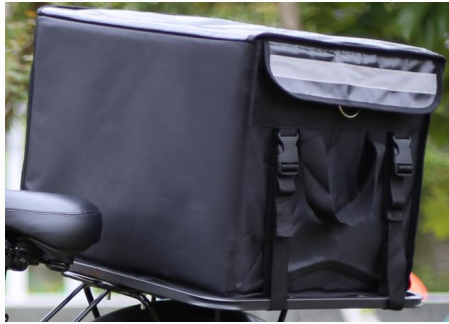
Delivery box & Rack