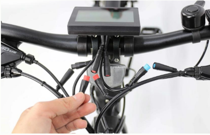
Quick release cable