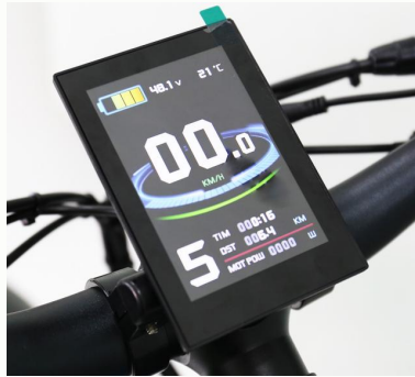
Color LCD8 display