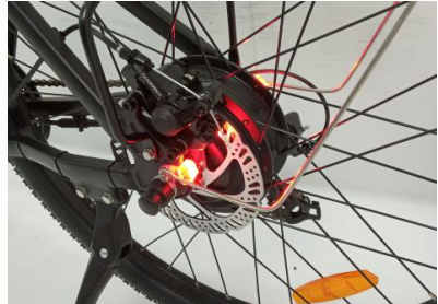
Rear flashing light